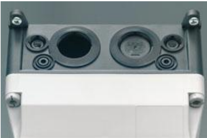
Standard pre-punched cable entries on the top and the bottom for M20 up to M40.