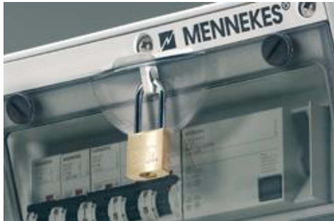
Window can be locked with a padlock, enclosure can be sealed.

Custom-tailored solutions or standard devices.