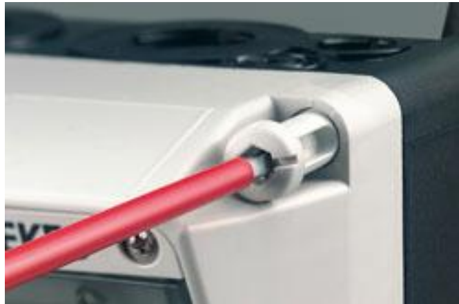
Especially fast opening and closing of the enclosure due to captive double-threaded cover screws.