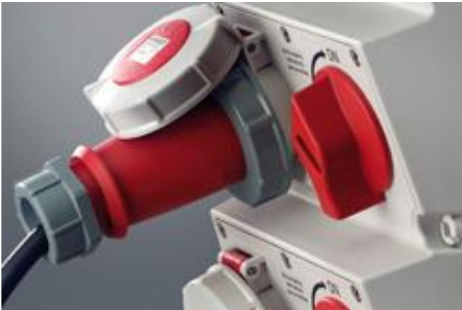
Generally angled insertion direction.